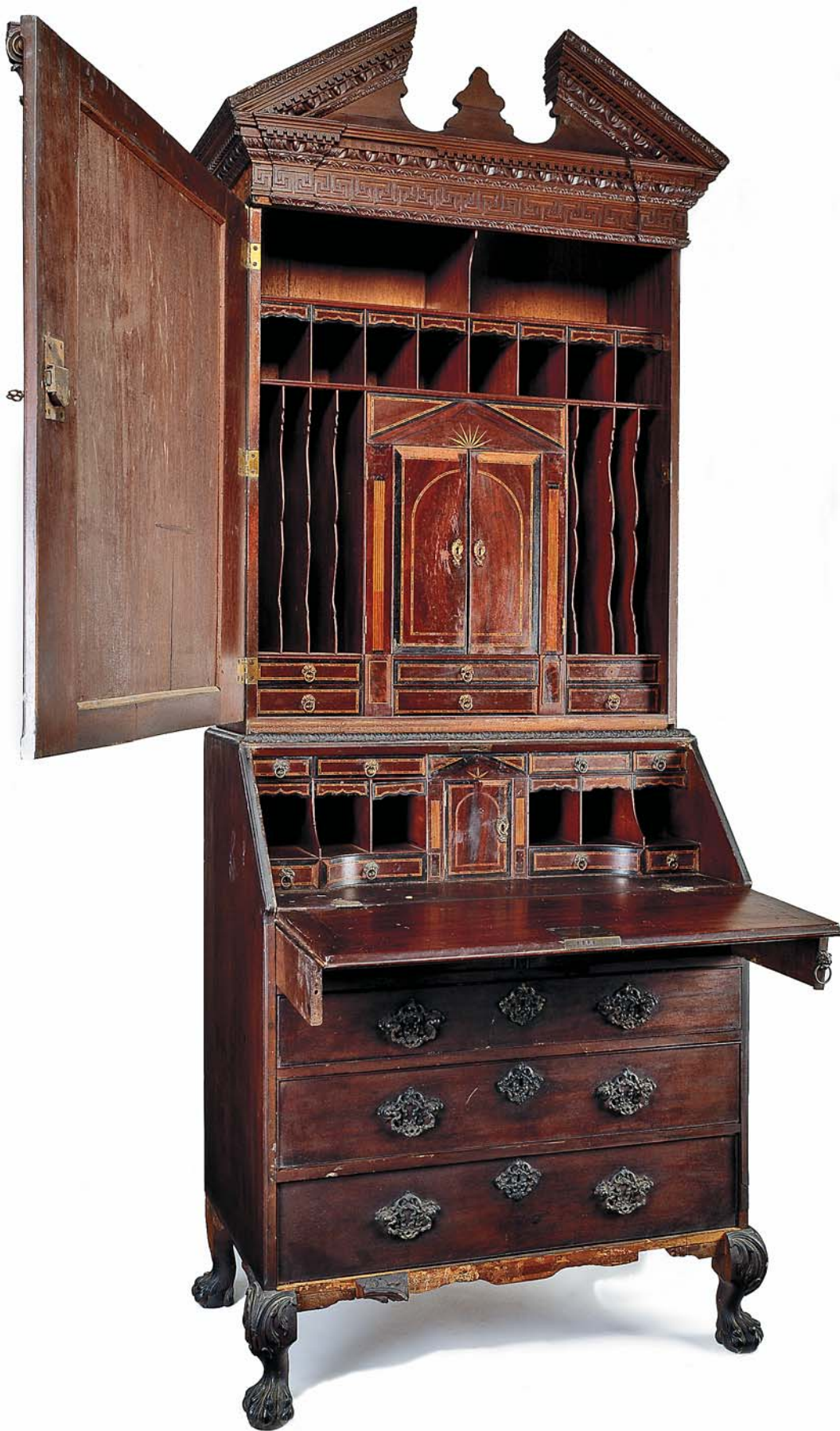
Fig. 10: Bureau bookcase, John Channon, London, England, mid-eighteenth century. 39 x 22 x 96 in. Original brasses and escutcheons. Donation of Charles H. Drayton. Courtesy, Drayton Hall, a historic site of the National Trust for Historic Preservation. Currently housed within the collections of the Colonial Williamsburg Foundation, Williamsburg, Virginia.

Constructed in two parts, the upper section of this rare example is topped with a broken pediment with a flush-mounted plinth in the center. The tympanum and frieze display a series of moldings composed of egg-and-dart, dentil, foliate, and Greek key motifs. The pediment surmounts an upper case with a single door flanked by two engaged Corinthian pilasters. The lower case consists of two-over-three graduated drawers below a fall board, decorated with cockbeading and veneered in mahogany. All associated rococo brasses and escutcheons are original. The desk interior exhibits a temple form prospect enclosing a compartment having an inlaid floor and a mirrored interior. The prospect assembly is in two parts, both removable. The upper portion is a drawer, the lower is a dovetailed case containing three small secret drawers at the rear. The prospect is flanked by projecting curvilinear sections containing pigeonholes, small drawers, and valance drawers. The drawers are veneered, inlaid, and crossbanded. The associated base repeats the leaf-carved molding of the pediment on carved ball-and-claw feet.