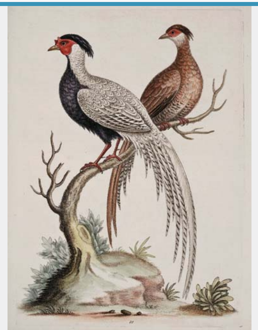
Fig. 8: George Edwards (1694–1773), The Black and White Chinese Cock Pheasant, with its Hen , plate 66, from A Natural History of Birds, Most of Which Have Not Been Figured or Described... Part II , 7 vols. (Royal College of Physicians, 1747).

George Edwards was born in Stratford, Essex, to a middle-class family. Following his early schooling and a seven-year apprenticeship in business, Edwards left England for mainland Europe, where he traveled extensively and became an expert in drawing natural history specimens. Such works were highly desired by wealthy collectors, such as Sir Hans Sloane, the President of the Royal Society and the Royal College of Physicians. Sloane quickly became Edwards' most significant patron and appointed him as the Bedell of the College of Physicians in 1733. While holding this position, Edwards furthered his studies in natural history and produced etchings of his work (Fig. 9). His first publication, entitled A Natural History of Uncommon Birds , was printed in four volumes between 1743 and 1751, and the three volumes of his subsequent work, Gleanings of Natural History , were published in 1758, 1760, and 1764. In total, Edwards produced seven volumes containing 362 etchings and detailed descriptions detailing recently identified natural specimens collected from the British Empire.